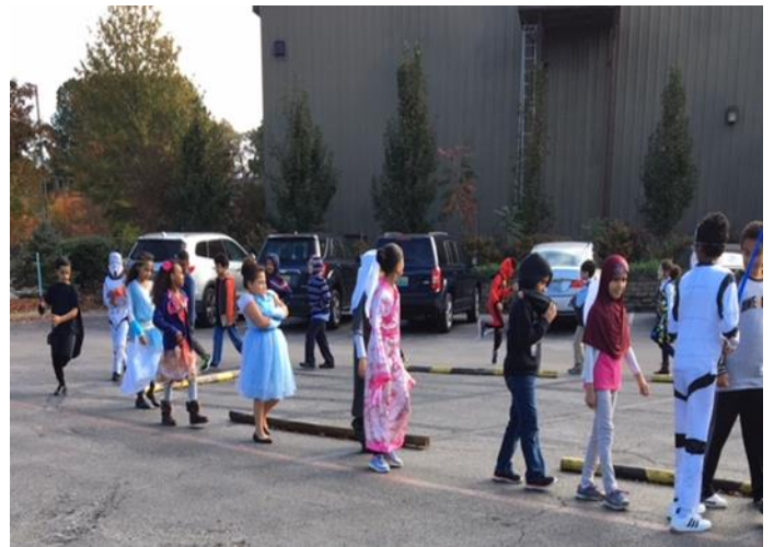
Left: Second and third graders built reading forts for fun places to read. Right: Book Character Day began with an all school parade.