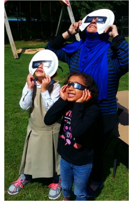
Above: first graders perform a play about the solar eclipse.