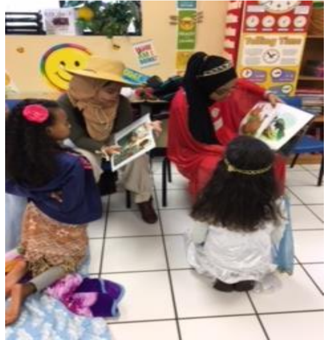
Sixth grade students read books to third graders (pictured here) and first graders on Book Character Day.