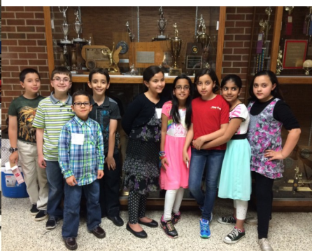
Technology State Fair Participation