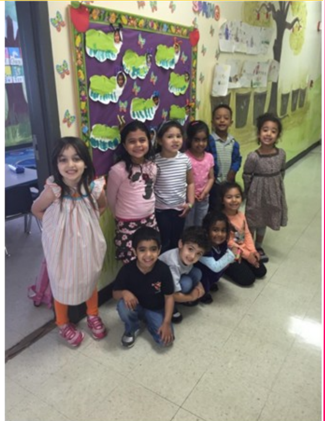
The pre k students were having fun with a spring project on caterpillars.