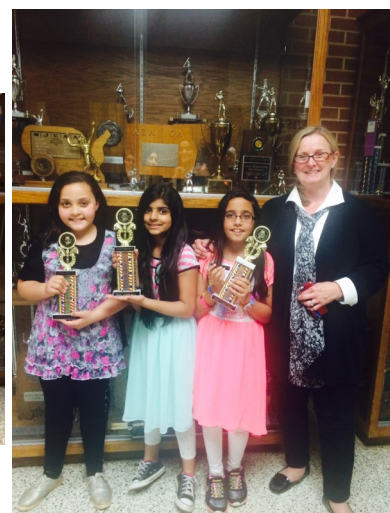
Technology State Fair Winners