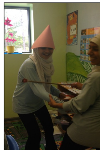
8th grade students are performing an Arabic skit.