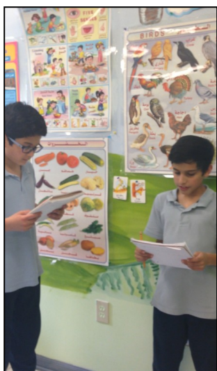
6th Graders summarize and present their assigned stories to the class.