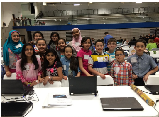
IAH students at the NW Regional Alabama Council in Technology Education Technology Fair

All IAH students experienced the thrill of presenting their projects, learned a little more about technology and hopefully will be better prepared for next year’s competition. A special thank you to all the teachers and parents who supported the late hours and the extra days of preparation.