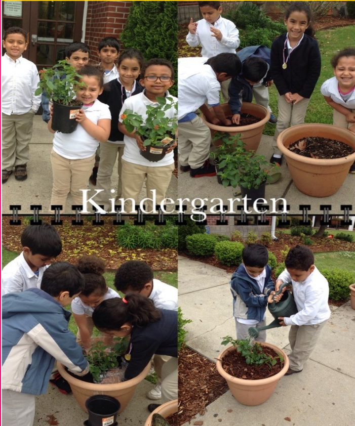
For Earth Day the kindergarteners planted flowers in front of the school. They had fun contributing to the earth and enjoying the spring weather!